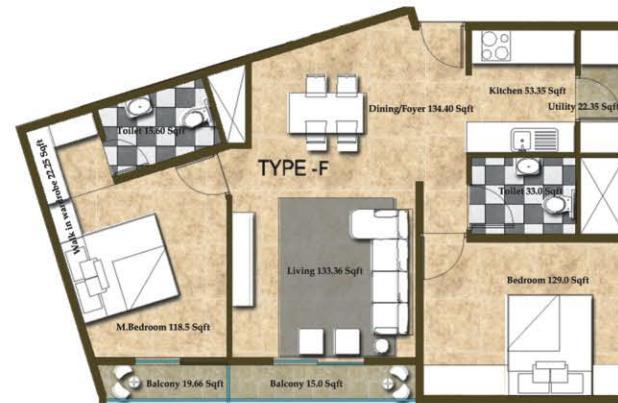
SBA - 1120 sft