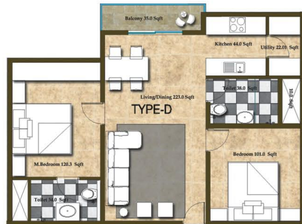
SBA - 940 sft