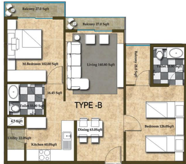
SBA - 1020 sft