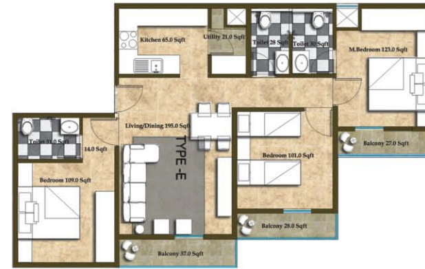
SBA - 1240 sft