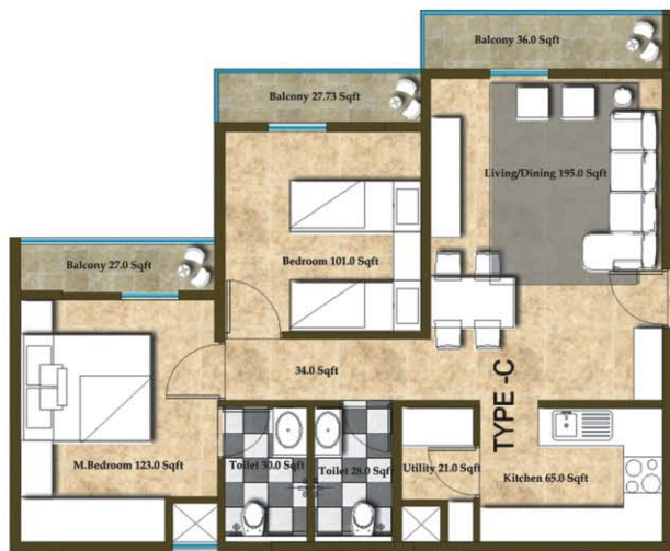
SBA - 1040 sft